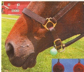
Protect horses from pests with the Ultrasonic Pest Repeller™.

Provide horses with 24-hour-a-day relief from annoying mosquitoes and other pests with the Ultrasonic Pest Repeller™ from AAI Safety Products.