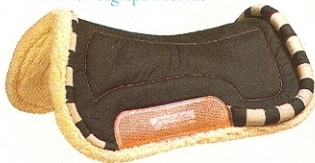
The Western Legends line is available from White Eagle Saddle Pads.

White Eagle Saddle Pad Company, www.weaglepads.com .