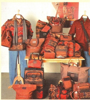
Travel in style with Pendleton's Signature Luggage Collection.

With a rugged , Native American-inspired fabric, the new Signature Luggage Collection from Pendleton Woolen Mills is the only way to pack for a trip.