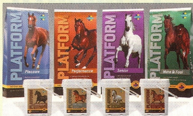
Platform™ is the first feed line offered by Farnam Companies.

Farnam Companies Inc., Box 34820, Phoenix, AZ 85067-4820; 800-234-2269; www.farnamhorse.com .